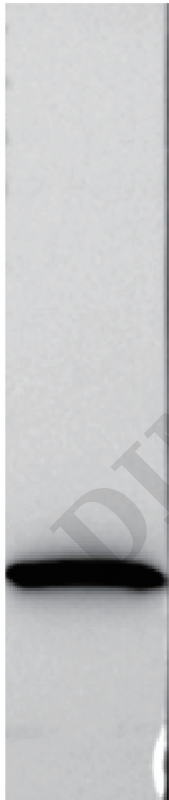
Figure 2. Anti-UCHL1 antibody (SKU# DME100843) at 1/1000 dilution

Lane : RAJI(human Burkitt's lymphoma B lymphocyte), whole cell lysate