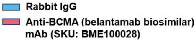
Figure 1. Flow cytometry analysis of human BCMA overexpression using Hu_BCMA K562 Cell Line (Cat. No. CEL100002) and Anti-BCMA (belantamab biosimilar) mAb (Cat. No. BME100028)