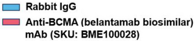
Figure 1. Flow cytometry analysis of human BCMA overexpression using Hu_BCMA K562 Cell Line (Cat. No. CEL100002) and Anti-BCMA (belantamab biosimilar) mAb (Cat. No. BME100028)