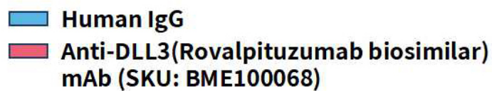
Figure 1. Flow cytometry analysis of human DLL3 overexpression using Hu_DLL3 CHO-S Cell Line (Cat. No. CEL100038) and Anti-DLL3(Rovalpituzumab biosimilar) mAb (Cat. No. BME100068)