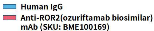
Figure 1. Flow cytometry analysis of human ROR2 overexpression using Hu_ROR2 CHO-S Cell Line (Cat. No. CEL100044) and Anti-ROR2(ozuriftamab biosimilar) mAb (Cat. No. BME100169)