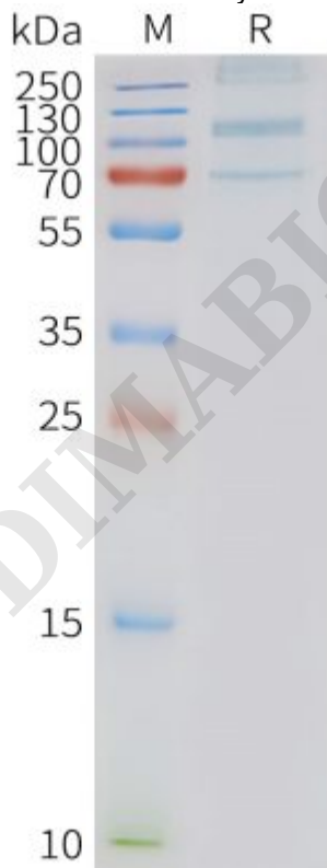
Figure2. Human ADGRD1-Nanodisc, Flag Tag on SDS-PAGE