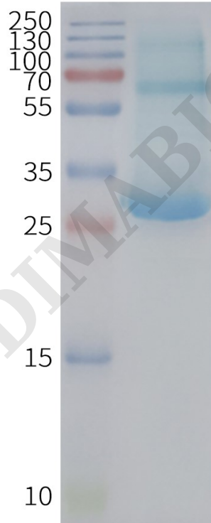
Figure2. Human ADGRE5-Nanodisc, Flag Tag on SDS-PAGE