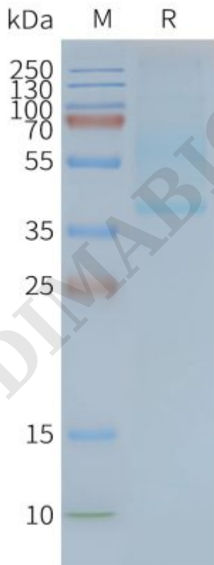
Figure2. Human CD47-Nanodisc, Flag Tag on SDS-PAGE