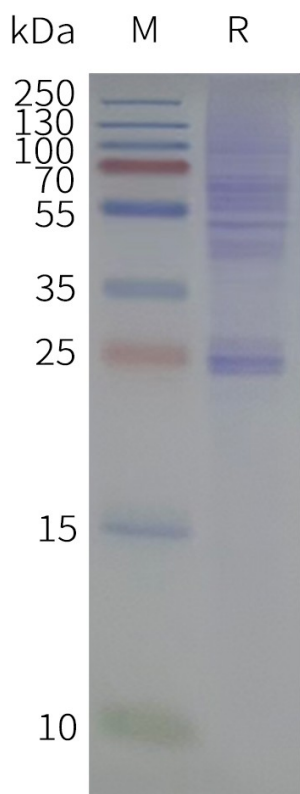
Figure 2. Human CLDN18.1-Strep-PeptiNanodisc, C-Flag&Strep Tag on SDS-PAGE