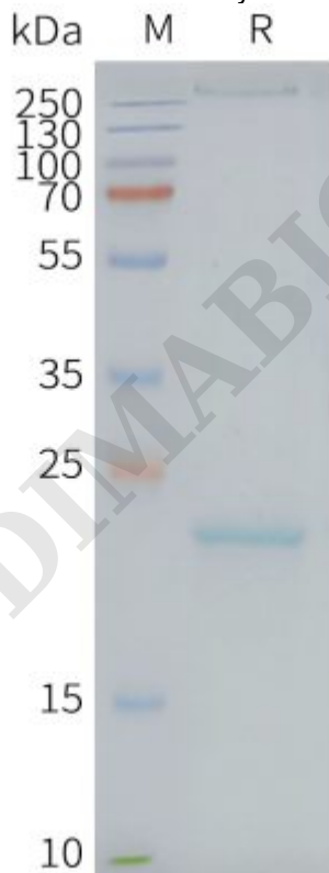
Figure2. Human CLDN9-Nanodisc, Flag Tag on SDS-PAGE