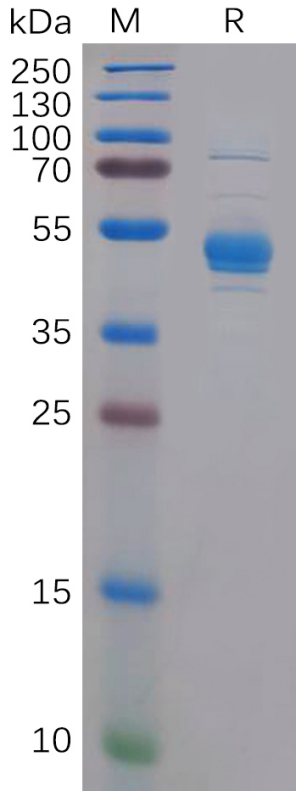
Figure 1. Human CLEC2D Protein, hFc Tag on SDS-PAGE under reducing condition.