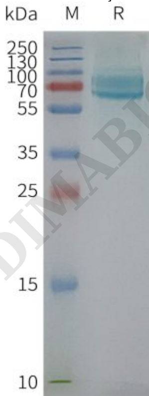
Figure2. Human CD39-Nanodisc, Flag Tag on SDS-PAGE