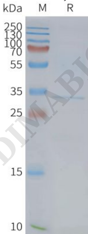
Figure2. Human FFAR1-Nanodisc, Flag Tag on SDS-PAGE