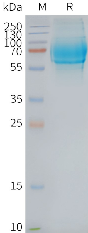
Figure2. Human GCGR-Nanodisc, Flag Tag on SDS-PAGE