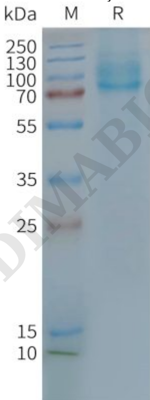
Figure2. Human GLP2R-Nanodisc, Flag Tag on SDS-PAGE