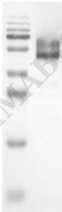
Figure2. WB analysis of Human HCRTR1-Nanodisc with anti-Flag monoclonal antibody at 1/5000 dilution, followed by Goat Anti-Rabbit IgG HRP at 1/5000 dilution