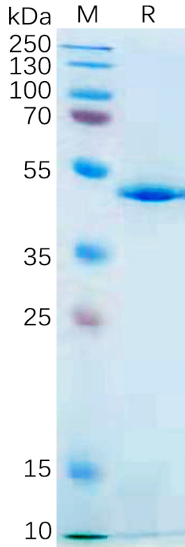
Figure 1. Human IL21 Protein, hFc Tag on SDS-PAGE under reducing condition.