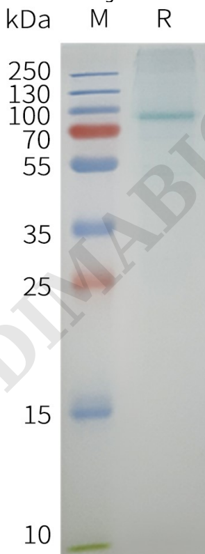
Figure 2. Human MBP-AGTR1-Nanodisc with N-MBP Tag, C-Flag Tag on SDS-PAGE