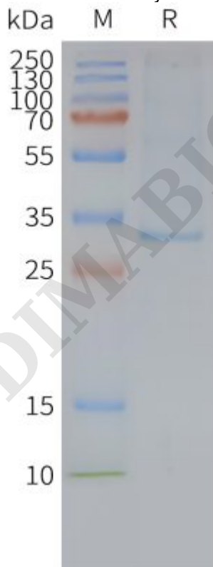
Figure2. Human MRGPRX2-Nanodisc, Flag Tag on SDS-PAGE