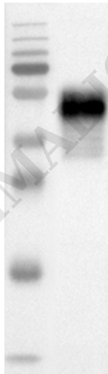
Figure 2. WB analysis of Human NPY1R-Nanodisc with anti-Flag monoclonal antibody at 1/5000 dilution, followed by Goat Anti-Rabbit IgG HRP at 1/5000 dilution