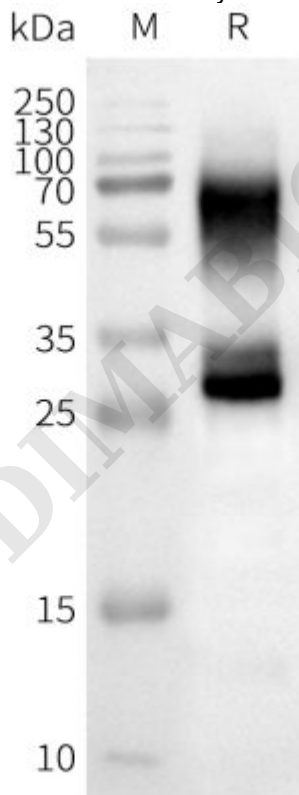
Figure2. WB analysis of Human OR2B3-Nanodisc with anti-Flag monoclonal antibody at 1/5000 dilution, followed by Goat Anti-Rabbit IgG HRP at 1/5000 dilution