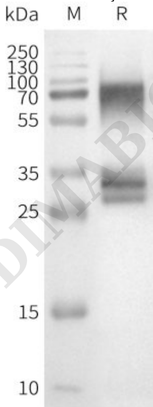
Figure2. WB analysis of Human OR3A1-Nanodisc with anti-Flag monoclonal antibody at 1/5000 dilution, followed by Goat Anti-Rabbit IgG HRP at 1/5000 dilution