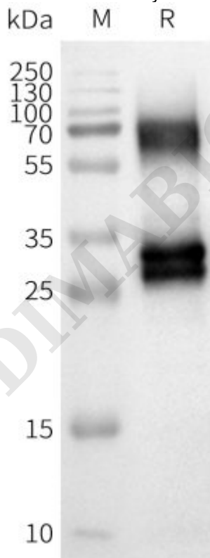
Figure2. WB analysis of Human OR8U8-Nanodisc with anti-Flag monoclonal antibody at 1/5000 dilution, followed by Goat Anti-Rabbit IgG HRP at 1/5000 dilution