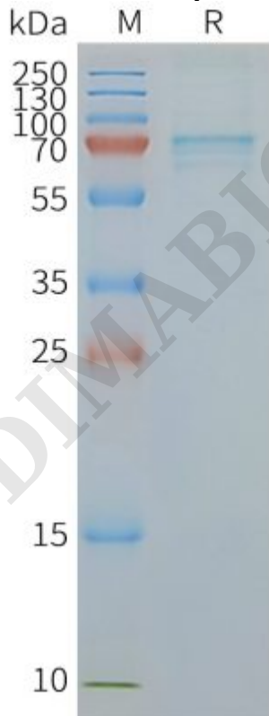
Figure2. Human P2RX7-Nanodisc, Flag Tag on SDS-PAGE