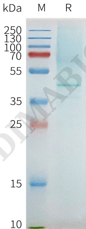
Figure 2. Human PTGER2-Nanodisc, Flag Tag on SDS-PAGE