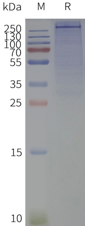
Figure 2. Human SCN2A-Nanodisc, Flag Tag on SDS-PAGE