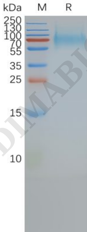
Figure2. Human SSTR2-Nanodisc, His/Flag Tag on SDS-PAGE