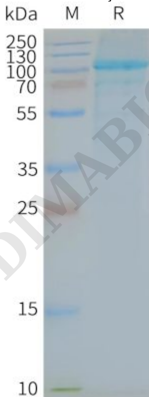
Figure2. Human TLR5-Nanodisc, Flag Tag on SDS-PAGE