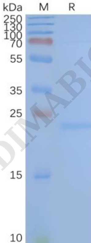
Figure2. Human TM4SF1-Nanodisc, Flag Tag on SDS-PAGE